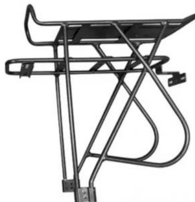
26 inch to 28 inch wheel mounted