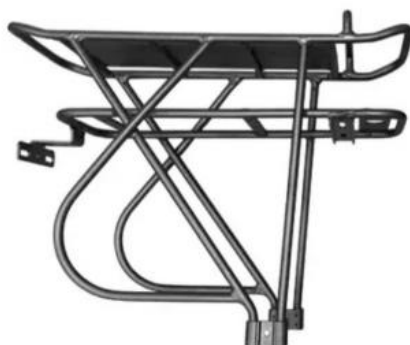
18 inch to 24 inch wheel mounted