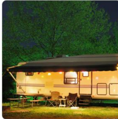
RV Energy Storage