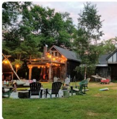
Home Back Up Electricity